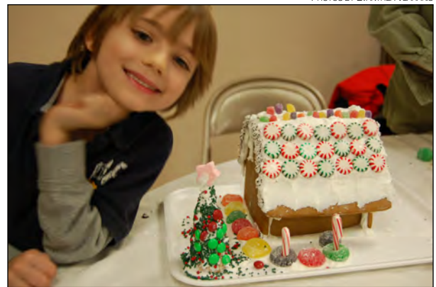
Kids and their families had a wonderful time decorating gingerbread houses at December's popular Family Night.